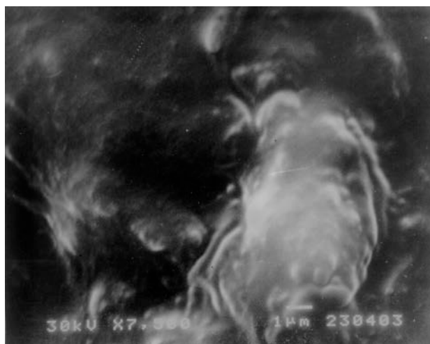
Slika 2. SEM mikrograf NR/CSM/ERP kompozita sa dodatkom 20 phr recikliranog gumenog praha pri uvećanju od 7500 puta

Figures have to be prepared for black-and-white printing, that is, if the original figure is in colours which cannot be distinguished in black-and-white printing, the colours have to be replaced by "raster", that is, different graphic signs which need to be explained in the legend. We insert in figures only the most essential text necessary for understanding, such as measure variables with their dimensions, short explanation on curves and similar. The rest is stated in the legend under the figure. The maximum size of a figure is 13 cm x 17 cm.